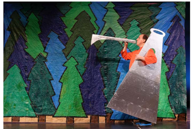
Kevin Richard Woodall as the Tree Angel, 2008