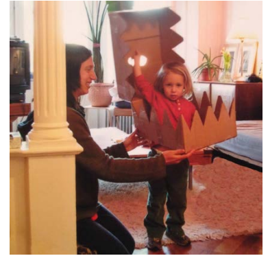
A homemade alligator